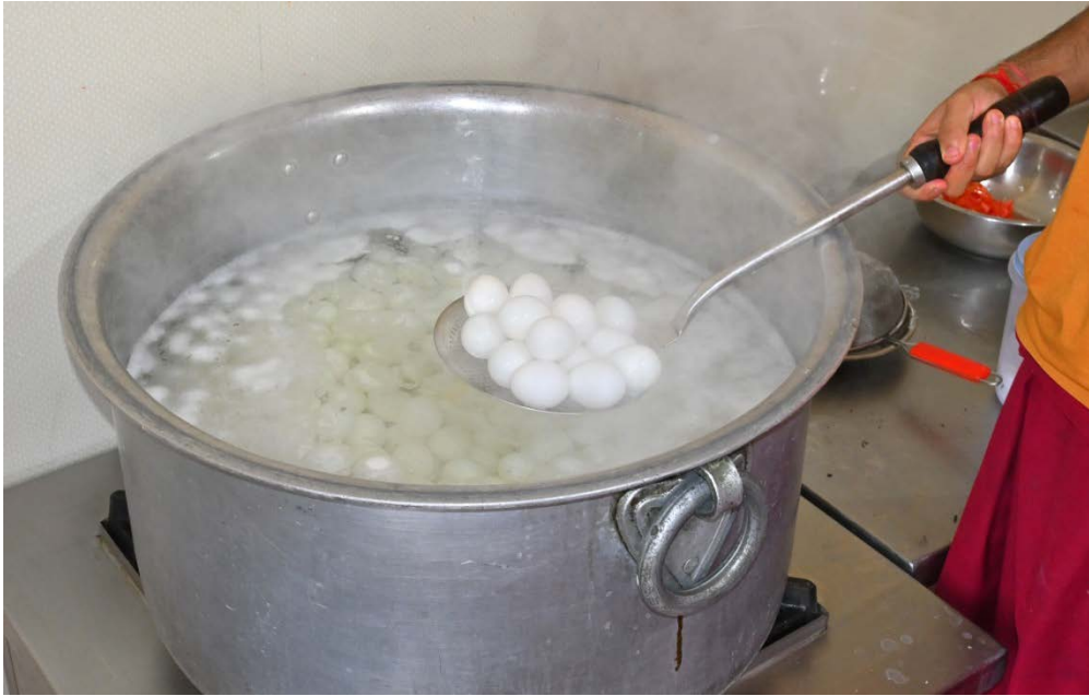
Extra-diet of eggs for the children