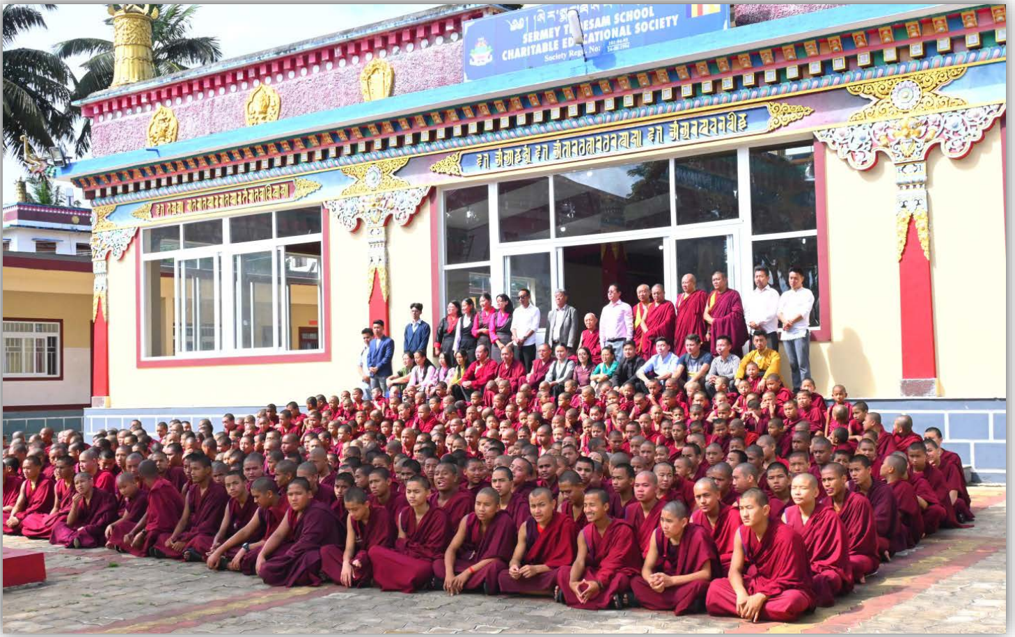
Sermey Thoesam School - Children & Staff with the Abbot of Sera Mey Monastery - October 2022