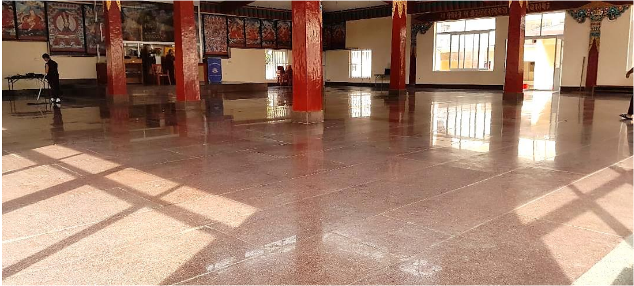
Old Debate Courtyard repurposed as School Hall with addition of walls and windows (outside/inside photos)