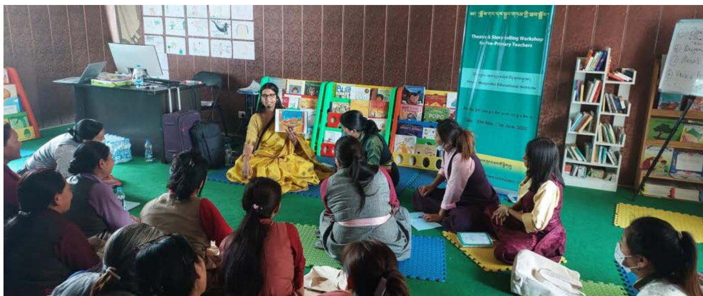
Workshop in progress - by one of the Facilitators from Goa