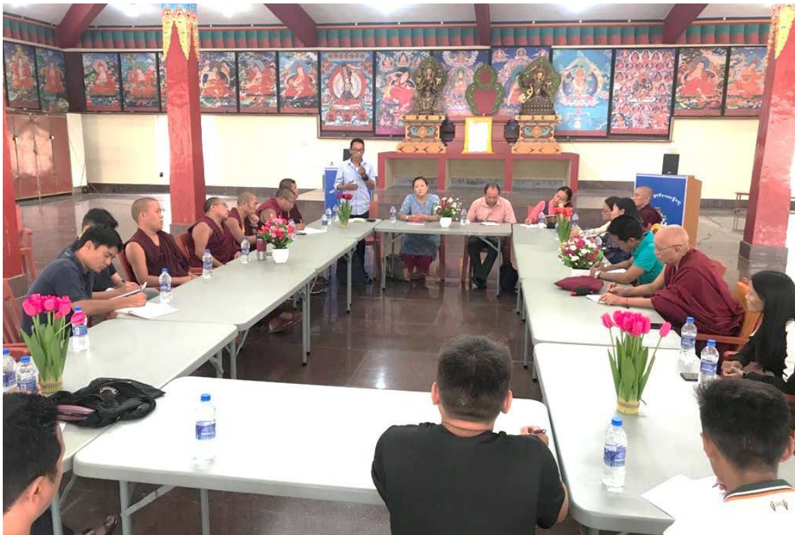
The maiden Teachers' Professional Development session in progress...

All the teachers of the School participated and made their presentations to share their experiences and insights for "a common and shared professional development". In each session 3-4 teachers made their presentations on different School teaching, learning & discipline relevant subjects to the audience. These sessions were held monthly from April till December (but no session was held in November due to School break). All the teachers participated with their Presentations and gave very positive feedback about the sessions being of a good learning experience of participation, analysis, exploration, objectivity etc.