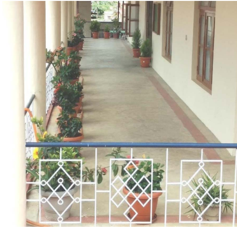
Office, Exam Committee Room and Guest Rooms