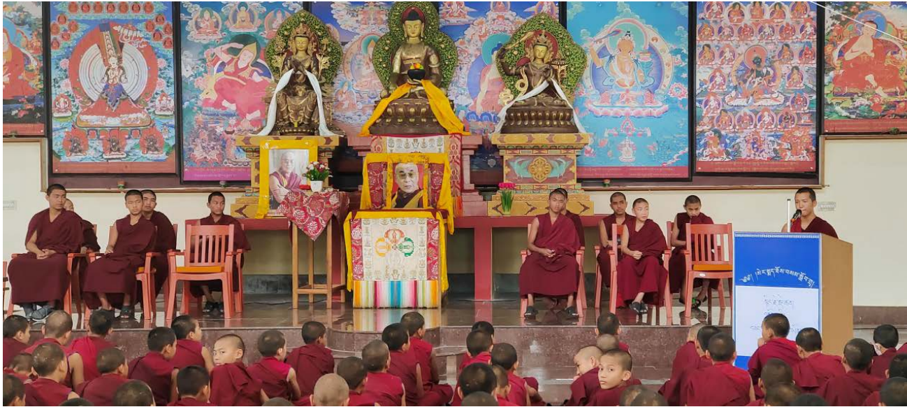
The Debate in progress...the competing participants on the dais