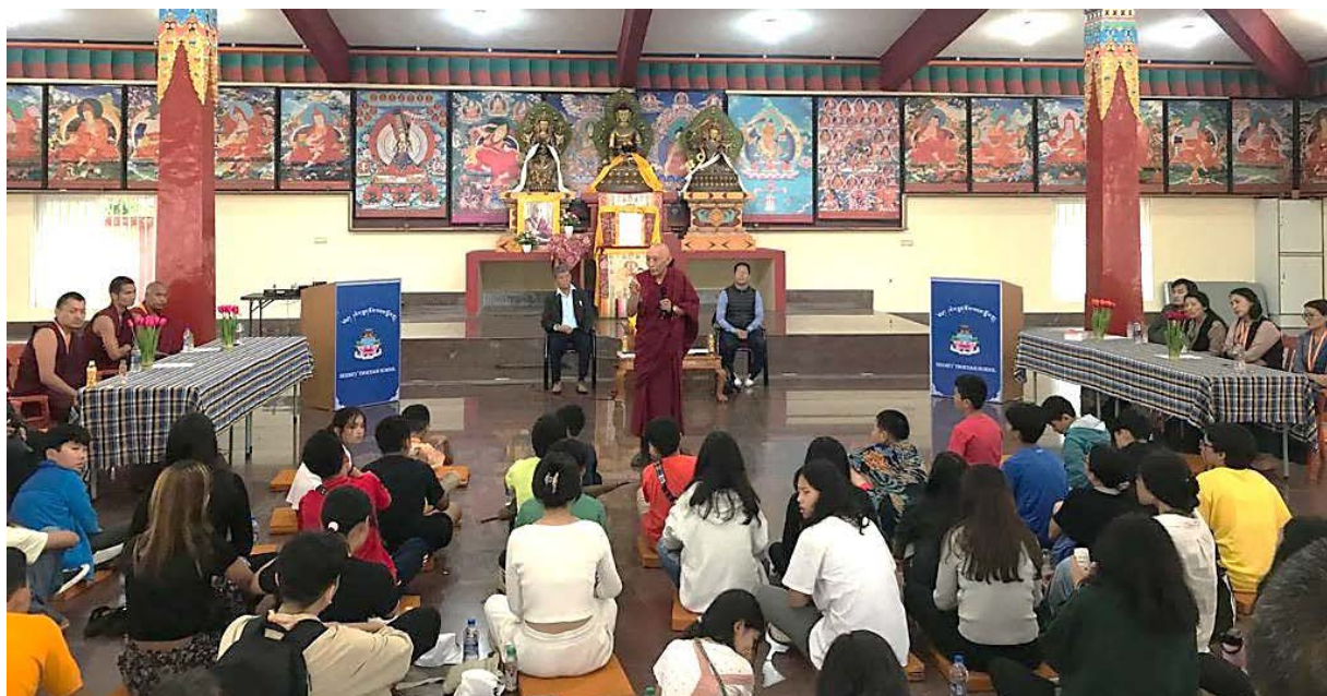
Interactive session with the visitor by presided over by the Abbot Sera Mey Monastery

We were happy to welcome and host a group of Tibetan students from the US who were on a visit to Sera Jey Monastery for the Summer Camp - a total of around 60 children. Most of these boys and girls are American-Tibetans born and brought up in the US and having known only the American way of life. They were shown around the School, interacted with the children and the teachers. Later on there was a Q&A Session in the School Hall presided over by the Abbot of Sera Mey Monastery and the School staff. Cold drinks and snacks were served to all. We hope that it was a good learning experience for them - an experience of empowering assimilation!