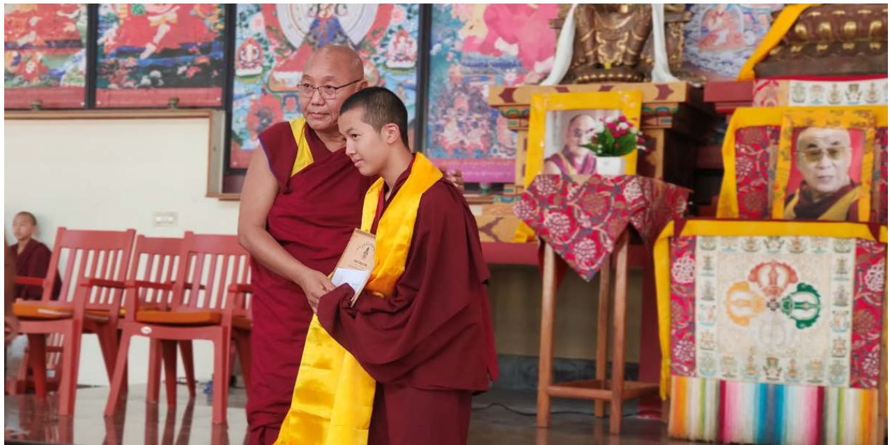
English Debate prize presentation