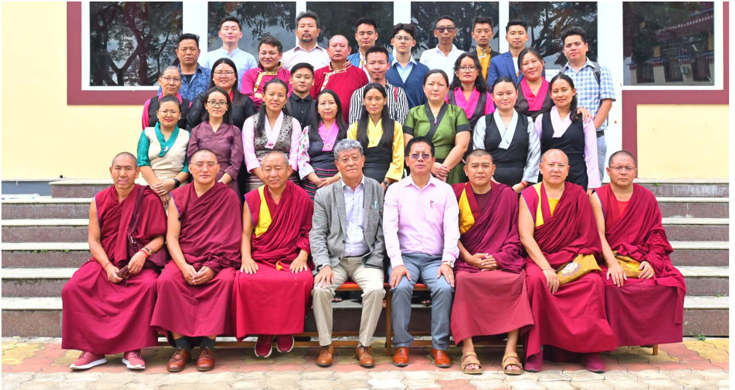
School teachers and Office staff - October 2022