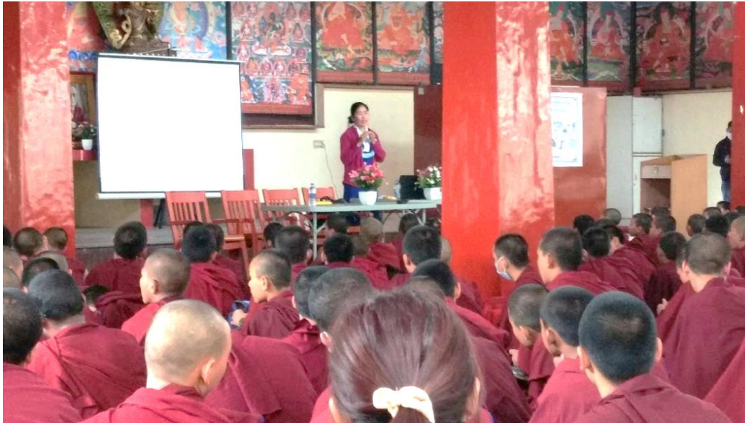
Health Centre Nurse doing the Presentation