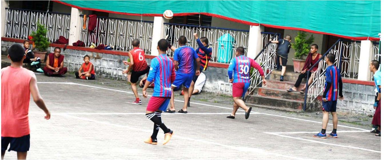
Football match between senior class sections