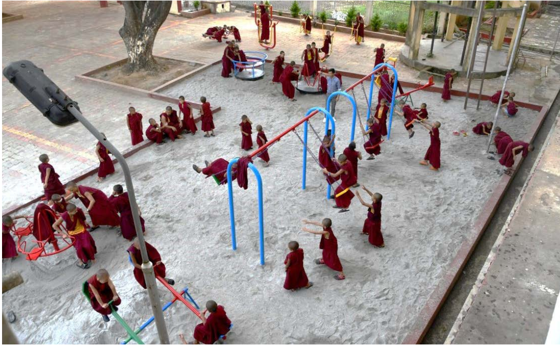
Children enjoying the games...