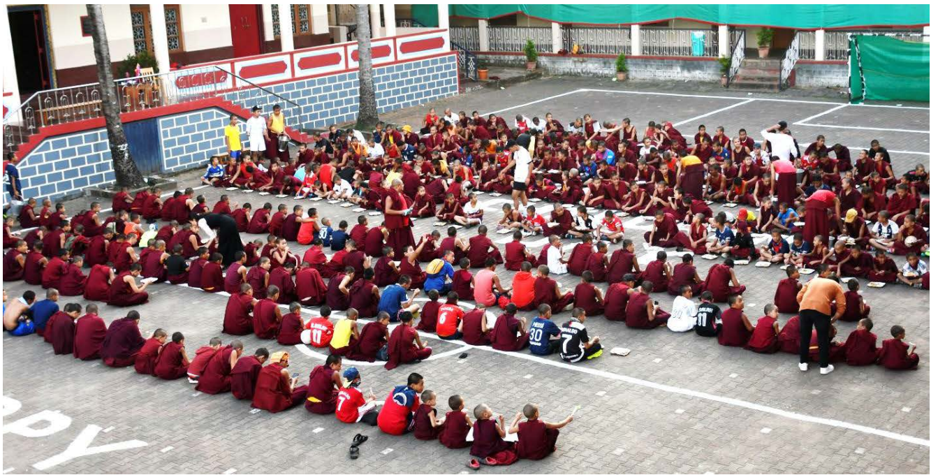
It is lunch time!!!