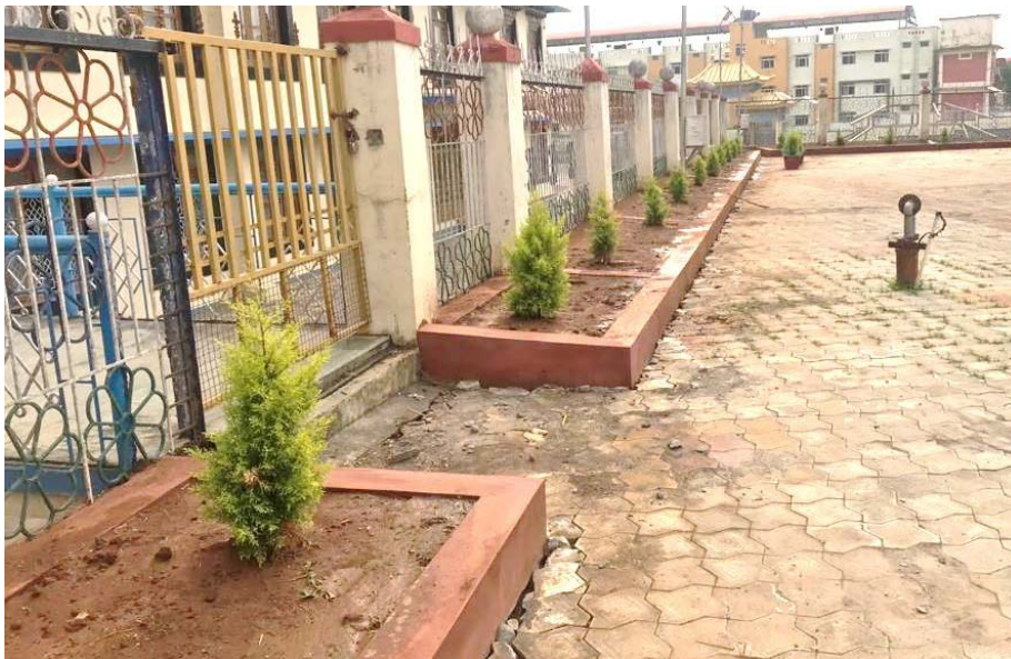
Tree plantation - School Senior Section area

Tree plantation and also a number of flower beds and pots are now dotting the School compound making it greener, colorful and a joyful place. [